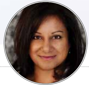
BY VANESSA FRANCIS

Pretty patterns, a custom headboard and DIY moulding combine to create a preppy cottage-style bedroom